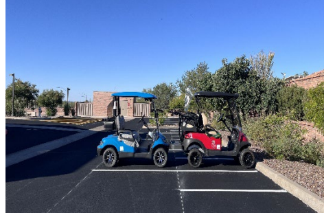
Tandem Parking Side View