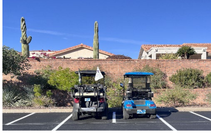
Side by Side

Help us make room for all by parking within the lines!